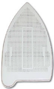
SY PC VEIND