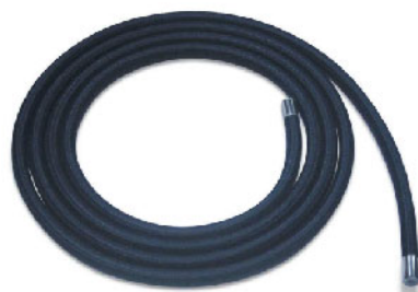
Silicone Hose For Electronic Ironing