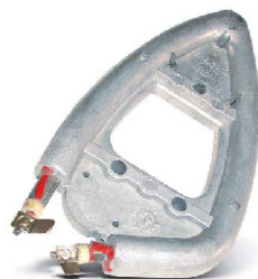
Iron Sheet Cap