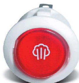
Round Illuminated Switch