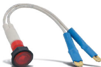
Iron Sheet Cap