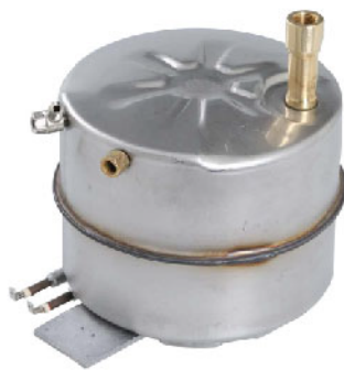
Iron Sheet Cap