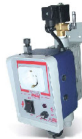
Spring and Hose Included