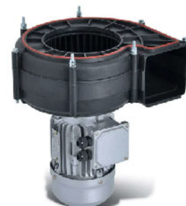
Potent Snail Radial Fa