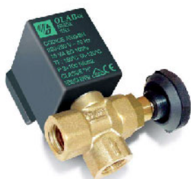
Olab Solenoid Valve