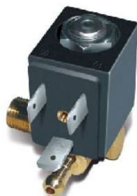
Olab Solenoid Valve Ola